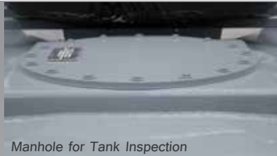
Manhole for Tank Inspection