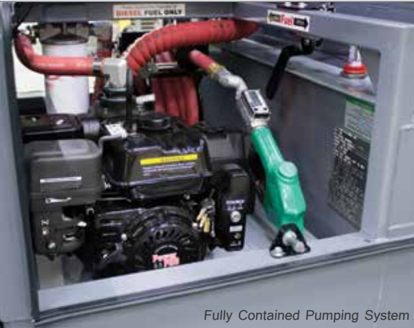
Fully Contained Pumping System